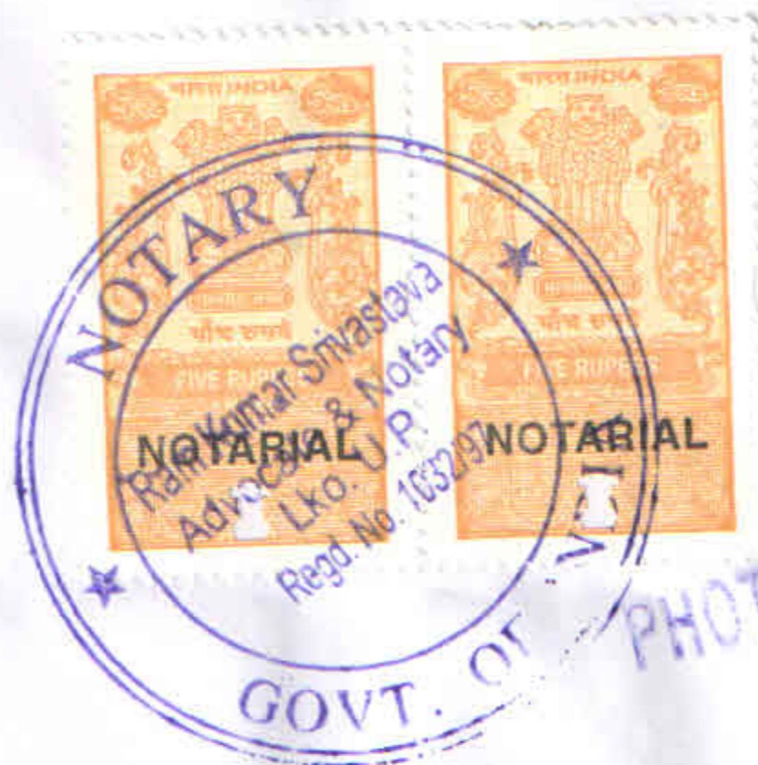
PHOTO COPY ATTESTED